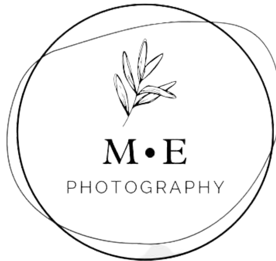
Madison Emily Photography Branding & Lifestyle photographer